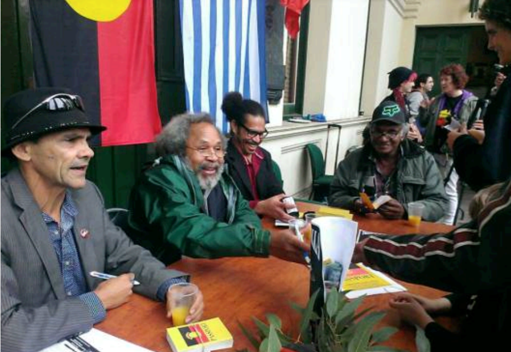
Aboriginal passport and West Papua Visa Ceremony, Victorian Trades Hall, 1 June 2013

Indigenous Elders deliver Sacred Waters from a spring in Arabunna Land in Central Australia and Sacred Ashes from Tent Embassies to West Papuan political leaders during a short secret meeting in Torres Strait