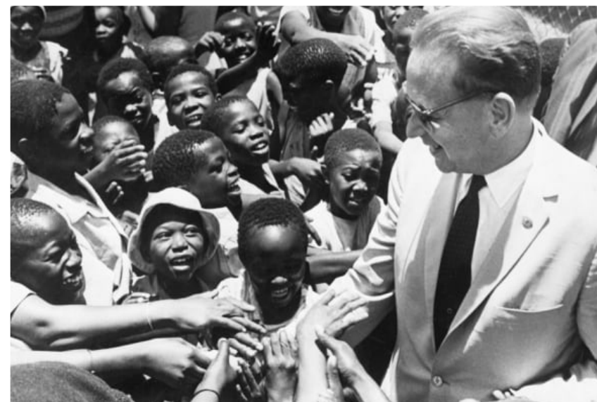
1. Dag Hammarskjöld, 1959.

The Secretary-General was a champion of decolonization and self-determination and oversaw seventeen independent states admitted to the United Nations between 1953 and 1960.