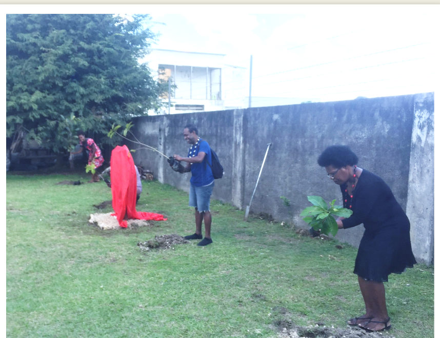
Tree planting ceremony Vanuatu, 2020