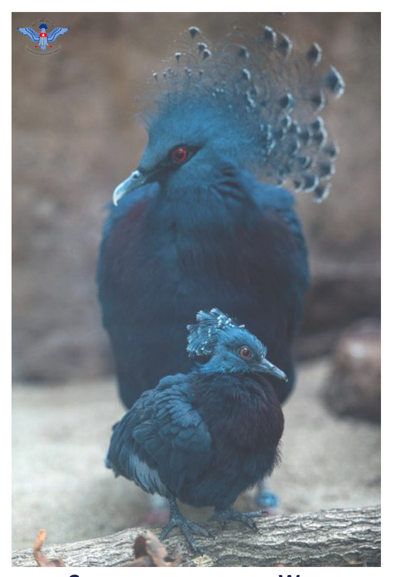
CARE TO JOIN ME IN THE WEST PAPUA RENT COLLECTIVE?