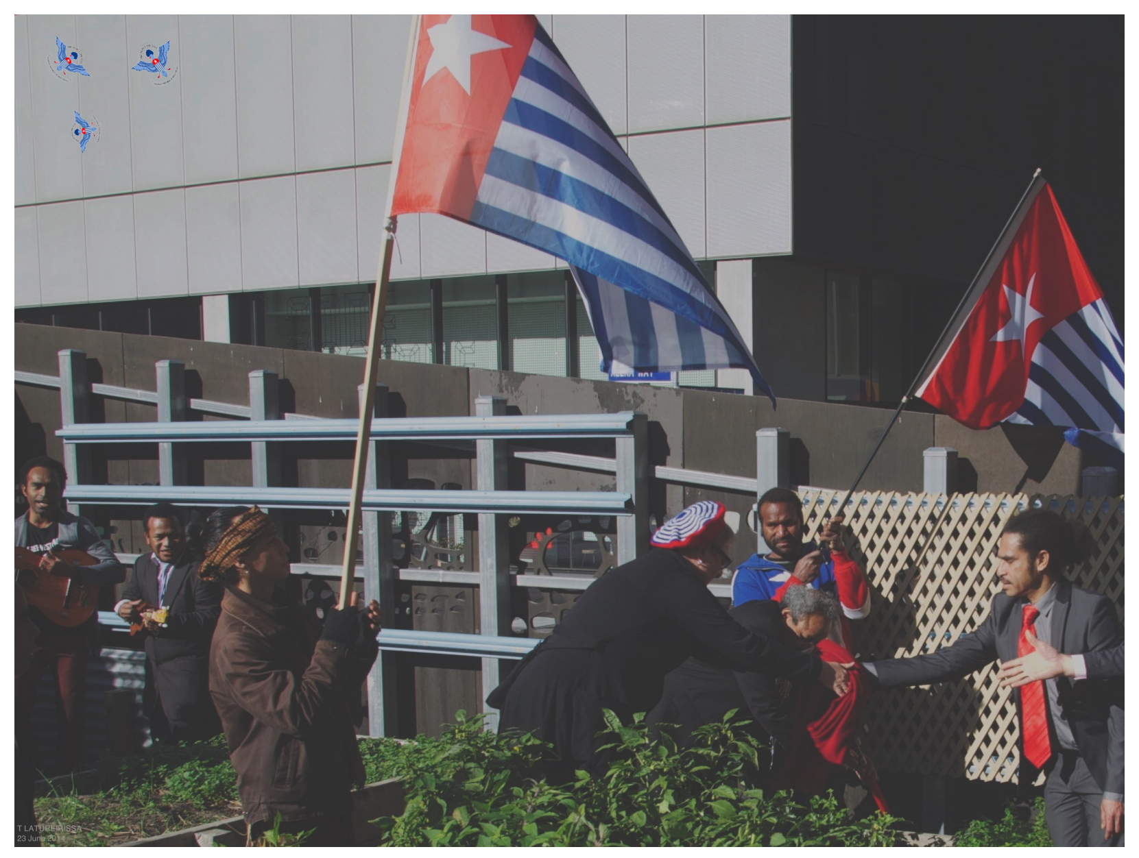
Community Garden, 838 Collins St, Docklands