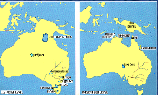
Australia-New Guinea: before and after the last Ice Age cycle