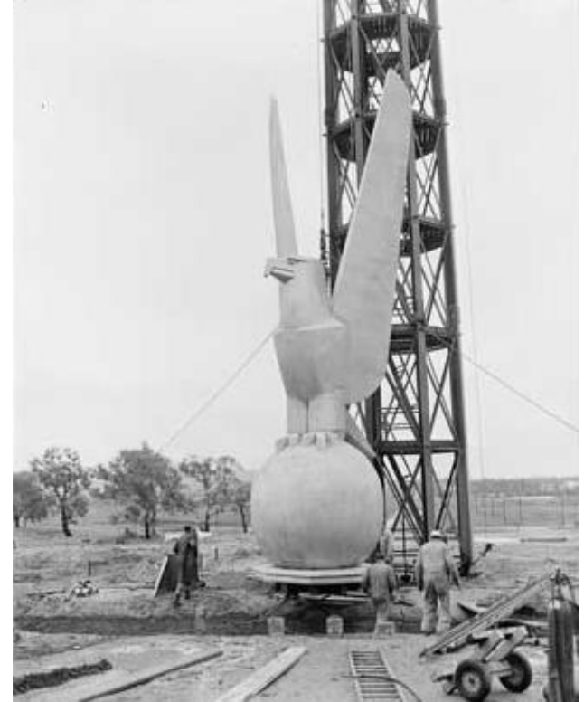
The Eagle and sphere, Australian–American Memorial at Russell Hill, 15 September 1953

THE ELEGANT NETHERLANDS AUSTRALIAN WAR MEMORIAL (UNVEILED IN 1991) DWARFED BY THE 79-METRE AUSTRALIAN AMERICAN WAR MEMORIAL (UNVEILED IN 1954), BLAMEY SQUARE, CANBERRA