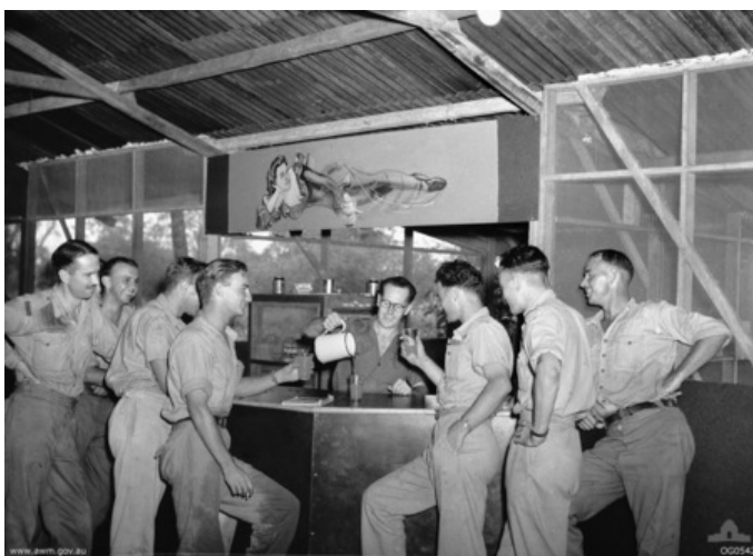
Australian aircrew at the mess bar in Merauke 1943-1944

over Merauke's muddy tidal flats to the fragile-looking ark their fathers had made for them. They had some biscuits, milk, and a few water bottles. They'd estimated they'd reach the Australian mainland in eight hours, but four days later they hadn't arrived.