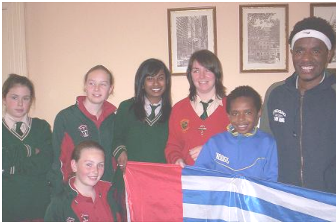
KILBREDA CATHOLIC GIRLS COLLEGE, MELBOURNE, JUNE 2016 Two of the young West Papuan 'boat people' sharing stories about their homeland with the girls at Kilbreda College.